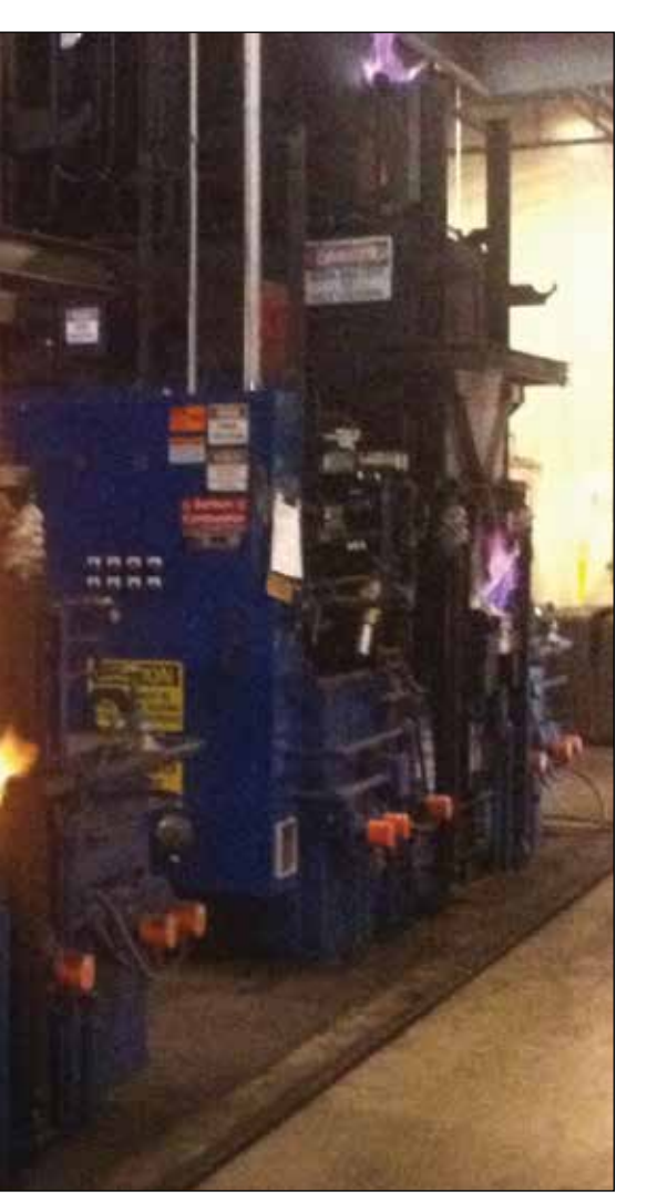
Batch Integral Quenching Furnace used for Carburizing Gears at Bluewater Thermal Solutions – Greensburg, IN.

precision tolerance gears, heat-treating has many requirements that must be met for case depth, surface hardness, core hardness, microstructure, and mechanical properties. Achieving these requirements can also pose challenges in manufacturing the gears to print requirements. You're an expert in manufacturing gears with machining, hobbing, shaping, broaching and grinding as core competencies, but heat treatment has always been a necessary evil that may not necessarily be your area of expertise. So instead of performing this operation yourself, you may decide to subcontract it to a commercial heat treater or have it performed by a captive heat treating department.