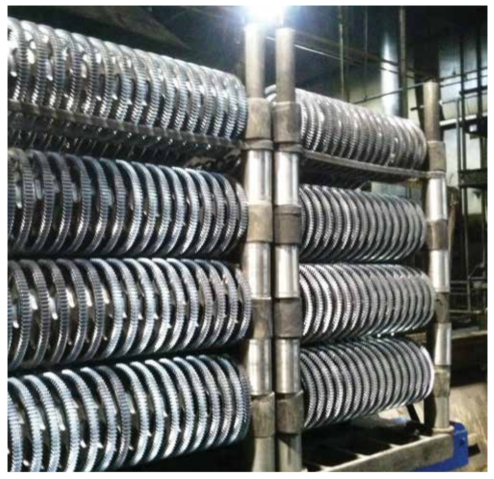
Figure 2: Carburizing hanging fixture for heavy truck gears.

of time. Hanging heavy gears can leave indentations from the hanging bars on the inner diameter bores of gears. Hanging bars should be ground smooth to prevent sharp edges or imperfections on the bars from indenting the gears. Additionally, placing gears on baskets, grids or heavy screens can leave marks and dimples on the bottom of the gears. This problem is more common for heavier gears with longer carburizing cycles, where a combination of high contact pressures and long exposures to high temperature allows for soft, hot gears to deform around the fixturing materials. Fine mesh screen or flat plates can be selected to distribute the weight of the gears more evenly.