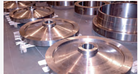
Machined forgings ready for shipment; upon customer's receipt, gear teeth will be cut and parts will be ready for use