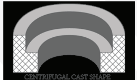
Figure 2: Centrifugal cast shape

to pounds per square inch, which is why this hybrid process makes it possible to make larger, more complex parts on an open die press. It's also a more efficient use of tooling and investment dollars; the tool design can be changed quicker and more effectively than closed die impression blocks or casting molds.