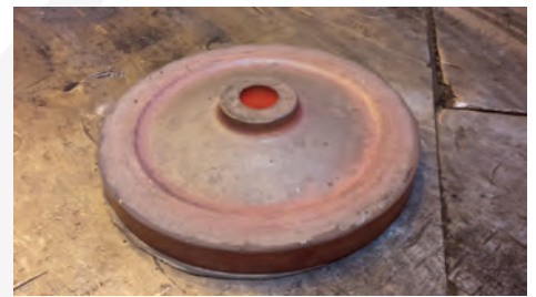
Bull gear that was previously welded as a three-component fabrication is now being produced as a single piece forging

Forging also provides means for aligning the grain flow to best obtain desired directional strengths. It is well-known that bridges are prone to cracking and fatigue problems. Therefore, it is helpful to understand how proper orientation of grain flow can ensure maximum fatigue resistance.