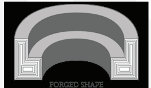
Figure 1: Forged shape