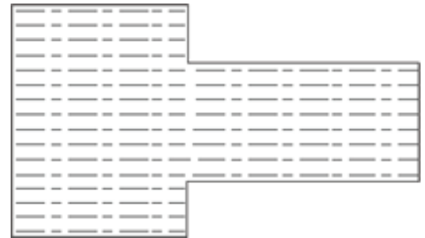
Figure 5: Machined grain flow

Virtually all open die forgings are custom-made one at a time, providing the option to purchase one, a dozen, or hundreds of parts as needed. In addition, the high costs and long lead times associated with casting molds or closed die tooling and setups are eliminated.