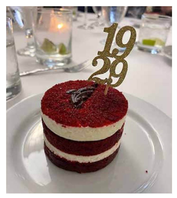
IHEA's 95th Annual Meeting was in the historic town of Savannah, Georgia. The first IHEA meeting was in 1929.

IHEA continues to educate the heat processing industry with its outstanding training seminars. This fall, IHEA will conduct its annual Combustion and Safety Standards and Codes Seminars September 17 and 18 at the Westin Poinsett in Greenville, South Carolina. The fall seminars also feature a joint Tabletop Exhibition & Reception on