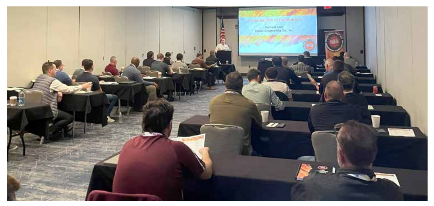
Attendees receive valuable technical information at IHEA's fall seminars.