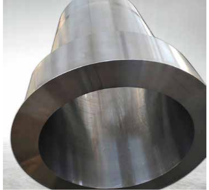
All Metals & Forge Group has been registered as an ISO company since 1994.