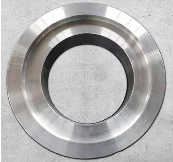
Forgings are a custom-made product with specific ultrasonic and machining requirements and made of different alloys.

//////////////////////////////////// “We’re a supplier of parts forgings involved in these various industries as well as supplying to other companies and manufacturers about how to improve, how to run your business, how to deal with the skills gap, how to deal with new technology, and software.”