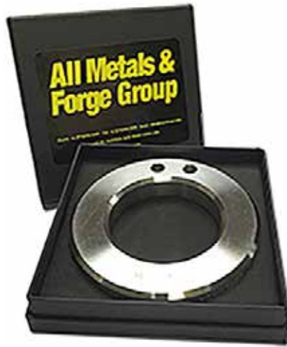
Every new customer receives a physical, hands-on example that is able to demonstrate a variety of All Metals & Forge Group’s skills.

With all its offerings, both physical and virtual, All Metal & Forge