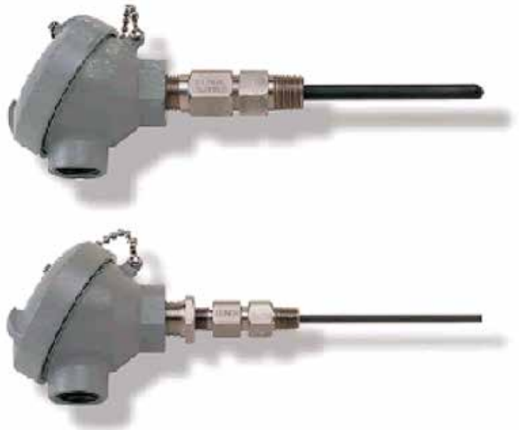
Figure 4: Selecting the right temperature sensor and knowing what to do with it can help increase product quality and production efficiency.

cable through a metal conduit. Finally, a 4 to 20 mA signal conditioner can be located at — or as close as possible to — the thermal element. The milliamp signal is much less susceptible to interference than the extremely low voltage from the sensor.