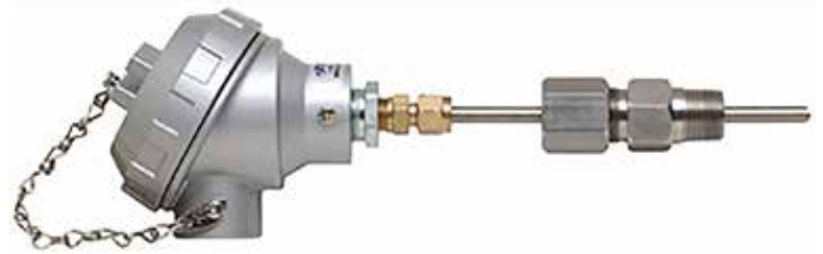
Figure 2: Decreasing sensor sheath mass increases response time.

Another is to properly secure all enclosure covers and run the