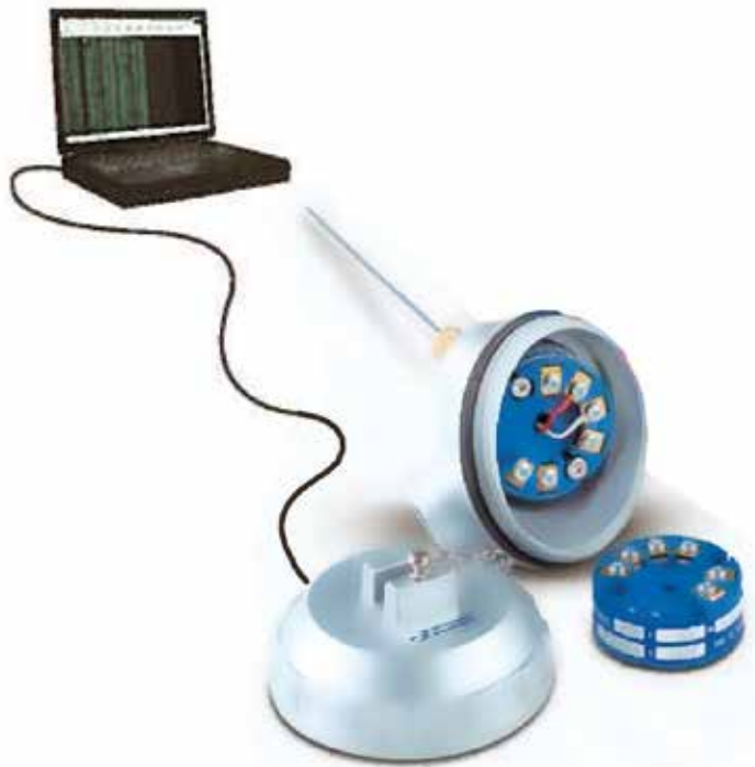
Figure 6: Temperature measurement accuracy is a function of all the elements in the system, not just the sensor. Transmitters and readouts also have an effect on total system accuracy.