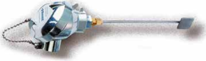
Figure 5: Weld pads maximize surface contact between the sensor and the surface to improve accuracy in surface mounting.