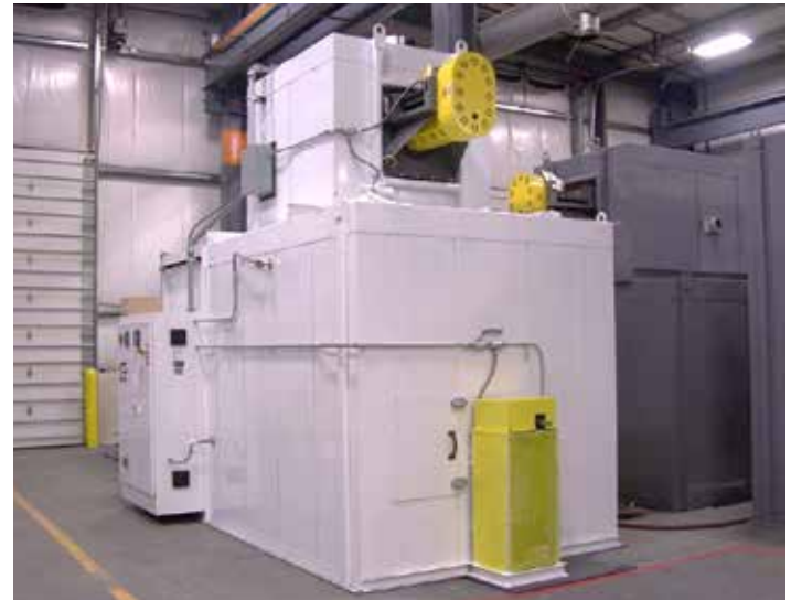
Figure 4: Rotator mechanism, painted yellow, located on rear oven wall.

In this design, the oven door is located on the top, and the wound mandrels are loaded into the oven via overhead hoist. The oven door is commonly opened using a chain-lift system, powered either electromechanically or pneumatically, mounted to the side of the oven. The door can also be manually operated in some cases. A counterweight can be used to reduce the lifting force required. Further, the door can be split into multiple sections, each of which are easier to lift than the entire door would be. As with the load-cart style oven mentioned earlier, there are roller-style supports inside the oven at both ends of the heating chamber. The ends of the mandrels rest on the rollers, which are rotated using a powered drive located outside the oven. The drive is coupled to a shaft penetrating the oven end.