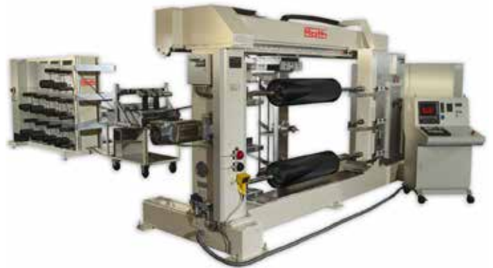
Figure 1: Filament winding machine.

In the cart-mounted rotator drive design, the load cart has an insulated plug (essentially a heat barrier) that sits between the gear drive and the heating chamber. The plug is mounted to the cart (Figure 3), and travels with it as the cart moves. It is located at the rear of the cart, so that when the cart is in position inside the oven, the plug closes off the oven opening, serving as the oven door. When the cart is outside the oven, the plug is out of the way,