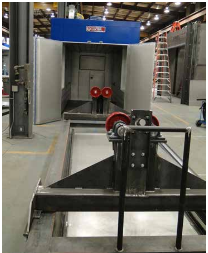
Figure 2: Cart-mounted support rollers on both ends.

permitting loading/unloading of the mandrels.