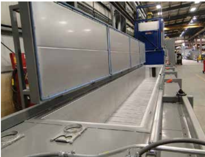
Figure 6: Top load oven design.

side walls, the same as in the cart style ovens, but can also be located at one end and direct the air axially down the length of the heating chamber, which is referred to as “end flow.”