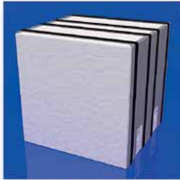
Superwool XTRA Pyro-Stack Modules