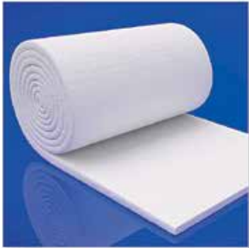
Superwool XTRA Blanket

The demand now is for a material that balances the performance of RCF with more stringent environmental safety. This is a significant challenge, because RCF has really strong characteristics that make it ideal for use in chemical processing, iron and steel processing, and ceramics factories.