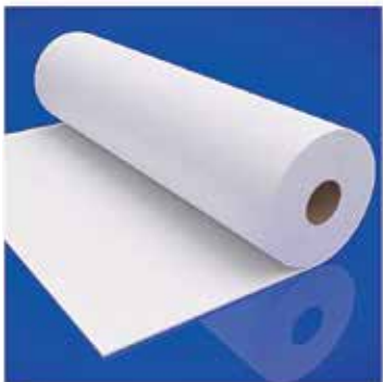
Superwool XTRA Paper