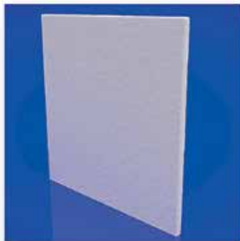
Superwool XTRA Unifelt