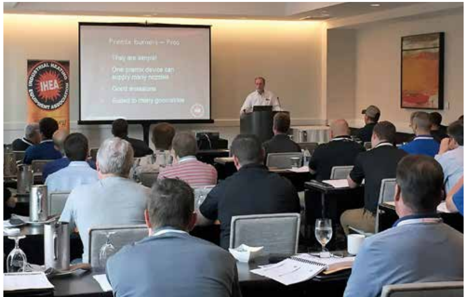
Attendees appreciate the opportunity to voice opinions and ask questions.

IHEA’s popular Safety Standards and Codes Seminar will provide a comprehensive overview of the NFPA 86, including newly released updates for many areas of safety. Sessions will cover the required uses of the American National Standards governing the compliant design and operation of ovens and furnaces. Speakers will cover the most recent revisions that are incorporated into NFPA 86. This seminar